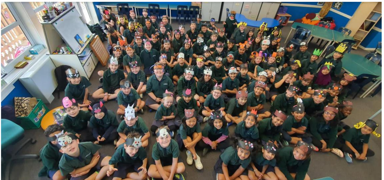
Te Pihī Syndicate: Here are some of the amazing fairytale headbands made during 'F' week